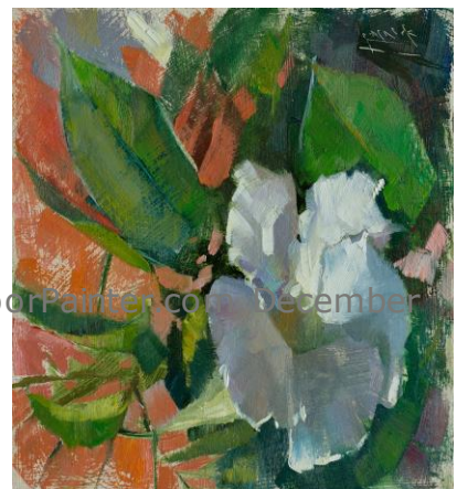
OutdoorPainter.com, December 2016